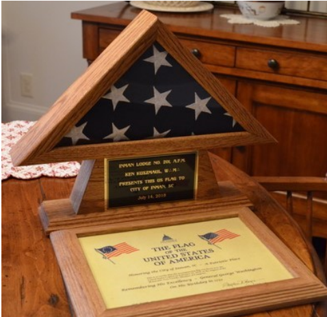
The flag that was presented by Congressman Trey Gowdy.